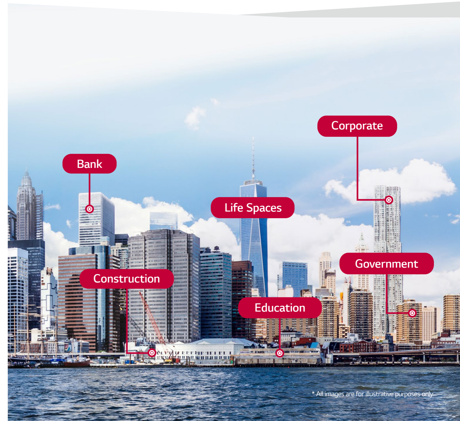
* All images are for illustrative purposes only.